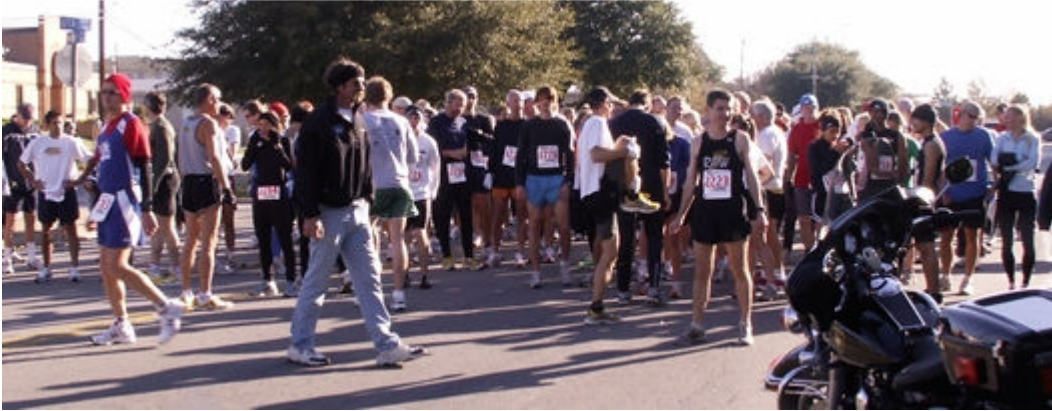
Runners were waiting for the start of the 10K at the Don Zetnick Winter Run.