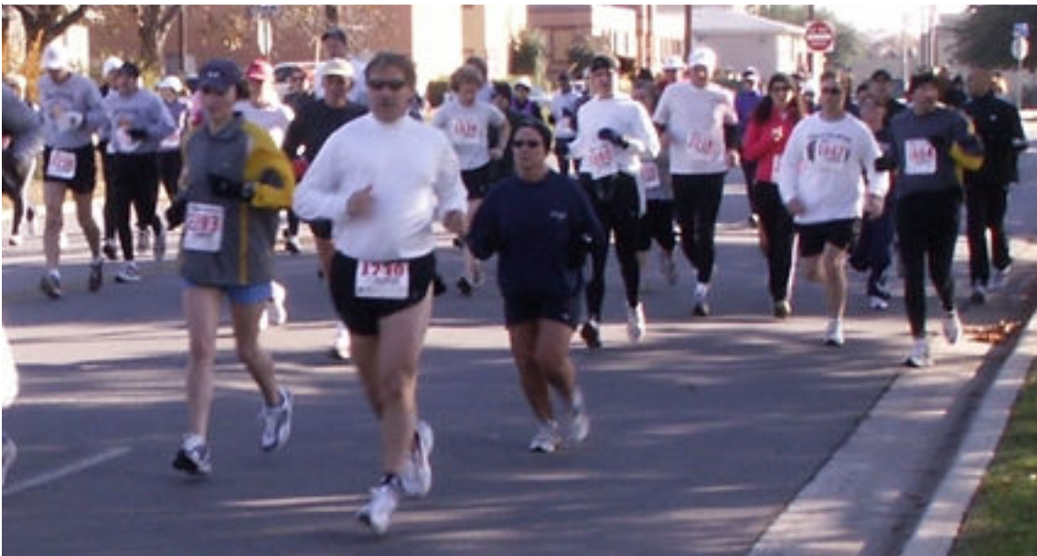
The 10K is off as the middle-of-the pack runners follow the leaders.