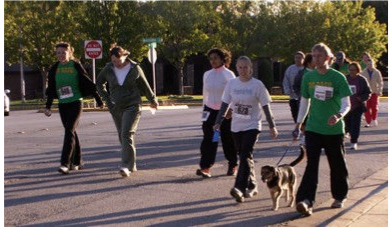
Who let the dogs out?