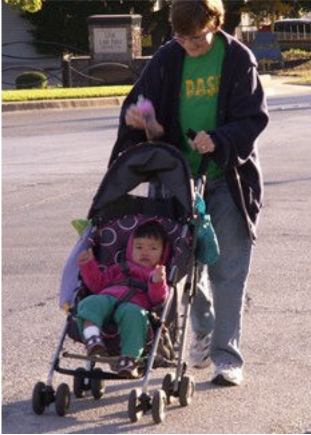
Some who didn't have a dog to pull them along, were pushing instead.