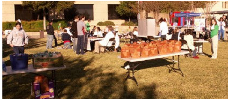
The DO Dash's Health Fair was set up and waiting for the runners to finish.