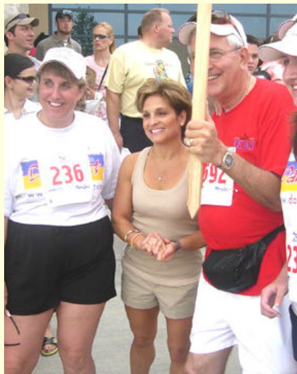
Mary Lou Retton, center, was the official starter for the Dad's Day 5K, June 17, at Pizza Hut Park in Frisco. Retton, who won the all-around gymnastics gold medal in the 1984 Olympics, also gave a talk and signed autographs. Retton became the first American woman to win the all-around gold medal. She also won five medals that year, the most of any athlete.