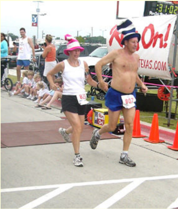
Mr. and Mrs. Seuss, no doubt.