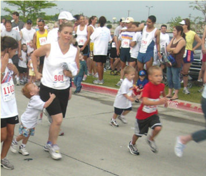
Latching onto help in the 50-yard dash.