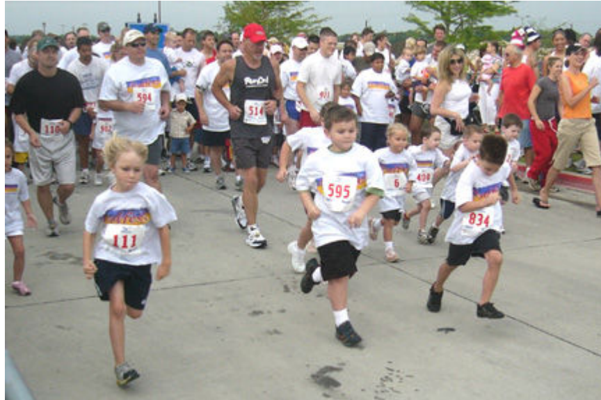
One of the several waves of children 5 and younger, who ran the 50-yard dash as part of the Dadfest, June 17, in Frisco.

FRISCO -- Overcast skies, cooler temperatures (mid to high 70s) Olympic gold medal gymnast Mary Lou Retton and high humidity greeted the participants at the Dadfest, June 17, at the Pizza Hut Park in Frisco.