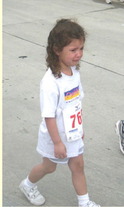
Sometimes 50 yards can seem like a long way.