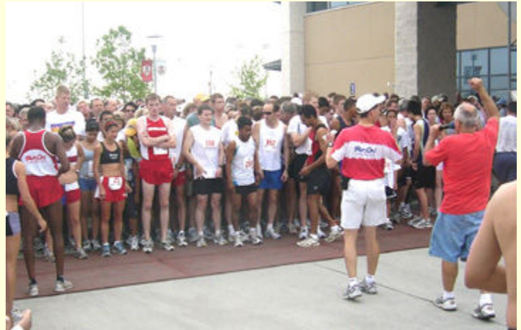
Runners line up for the Dad's Day 5K, June 17, at Pizza Hut Park in Frisco.

Dadfest had Mary Lou Retton as the official starter, and many activities were available for the youngsters at the Pizza Hut Park in Frisco.