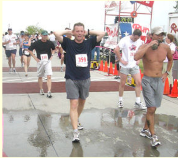
Some of the other finishers in the Dad's Day 5K. A few definitely seemed ready for the 3.1-mile race to end. Is fun run an oxymoron?