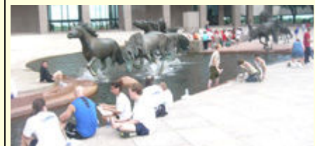
Eating with the horses.