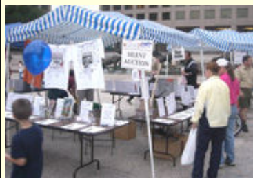
Looking over auction.