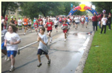
Chasing the leaders.