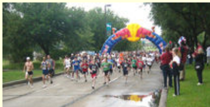
And they're off!