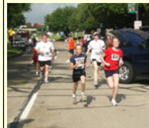
It's a sprint to the finish in 5K.