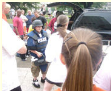
Trying on police vest.