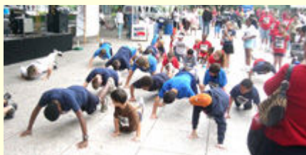
Youngsters warm up for race.